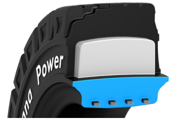
Durable three-layer construction