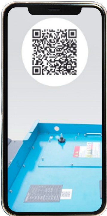
QR code reading

Continuously monitors the battery's operating condition throughout its life to ensure the safety of personnel and equipment.